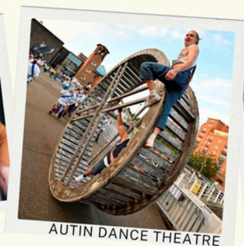
AUTIN DANCE THEATRE